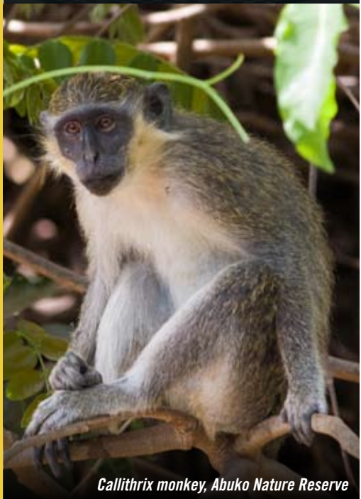
Callithrix monkey, Abuko Nature Reserve

For reservations or information, please call us at 800-257-5767.