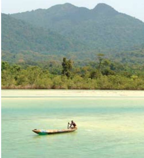
Fisherman in Sierra Leone