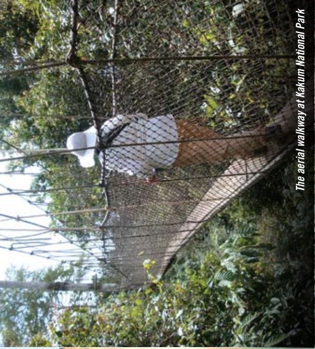
The aerial walkway at Kakum National Park

Travel Dynamics International Excellence in Small-Ship Cruising Since 1969 132 East 70 th Street, New York, NY 10021