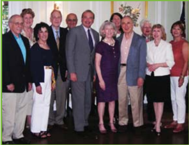
2010 Gala Committee