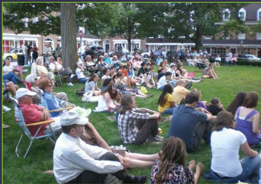
Hundreds of people enjoy an afternoon Musical Theatre Concert with their Friends and family in Princeton's Palmer Square